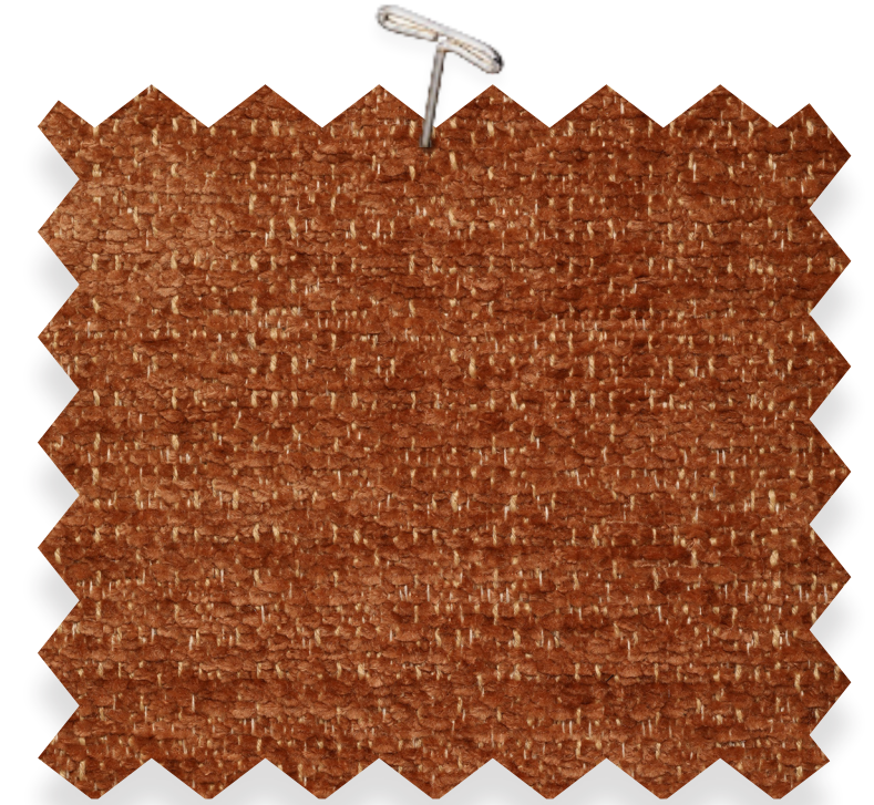
80 Spiced Cider