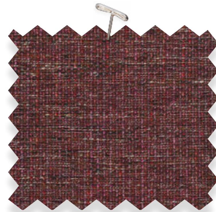
49 Mixed Berry